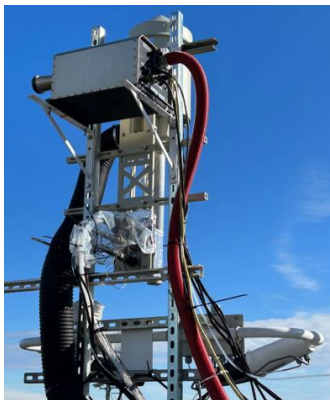
Figure 1. Fog droplet monitor mounted behind the ground-based counterflow virtual impactor on the Mt. Soledad site during EPCAPE (photo credit John Liggio, Environment and Climate Change Canada).

Throughout EPCAPE, the fog droplet monitor collected continuous in situ measurements of droplet number size distribution from 2-50 microns at a time resolution of up to 1 Hz and subsequently averaged to 5 min. The instrument was situated on the roof of the Russell instrumentation van at Mt. Soledad, with an approximate elevation of 200 meters (above sea level), right next to the inlet of the ground-based counterflow virtual impactor deployed by Environment and Climate Change Canada (see Figure 1). Data were recorded on a laptop that was secured inside the instrumentation van. Over the 12 months of EPCAPE, the FM-120 operated for 86% of the study period and observed cloud conditions (droplet concentrations > 1 \text{ cm}^{-3} and liquid water content > 0.05 \text{ g m}^{-3} ) approximately 4% of the time (a total of 306.9 hours over the entire study). Table 1 provides an overview of the monthly coverage and cloud occurrence.