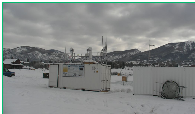
For SAIL, this ARM Mobile Facility will return to Colorado, where it collected measurements during the 2010–2011 Storm Peak Lab Cloud Property Validation Experiment (STORMVEX).

Using an ARM Mobile Facility (AMF). Mobile facility deployments are determined through a user proposal process. An AMF can be deployed for stand-alone campaigns or for collaboration with interagency experiments. Scientists interested in using an AMF are encouraged to submit proposals at the following web page: www.arm.gov/research/campaign-proposal .