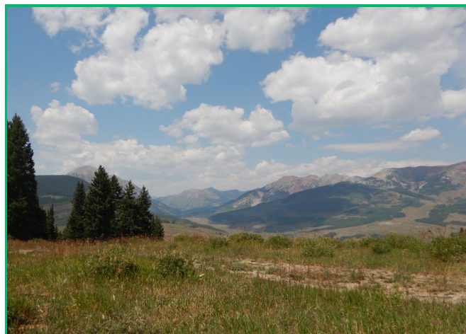
Colorado's East River Watershed, seen from Crested Butte Mountain, will be the focus of the SAIL field campaign.

SAIL will combine atmospheric measurements from ARM, a U.S. Department of Energy (DOE) Office of Science user facility, with existing surface and subsurface data from partner research organizations. Researchers will develop detailed measurements of mountainous water-cycle processes as they pertain to the Colorado River, which supplies water for 40 million people in the American West.